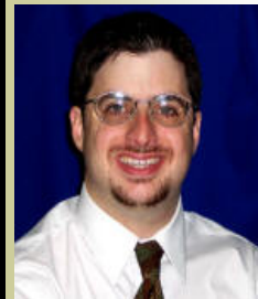
Dan Mancoff has placed helpful materials about Inspiration in the Tech Mentor folder on the shared teacher drive

Access passwords for remote access to these rich resources on Edline—there’s a link beneath the picture of the school on your opening page.