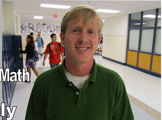
Staff Member Of The Month—April