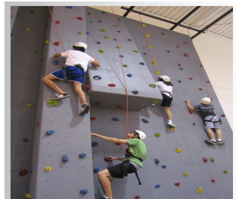
Students in summer team building class

www.rbhs208.org/Patrons/PatronsCouncil.htm